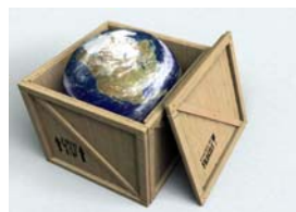
“We can deliver to every corner of the globe giving you a world of opportunity.”

Operating in the complex international courier and logistics market may seem like a daunting prospect. However, the SMA Franchise model makes it simple and straightforward . All you need to do is sell the service to potential clients, organise your local driver to collect parcels from them and deliver those daily to an SMA Distribution Hub. The support teams at SMA Head Office take care of the rest leaving you free to concentrate on acquiring more clients and managing your client base as it rapidly expands. That's why our franchisees need sales and marketing skills but there is absolutely no need for them to have experience in this industry.