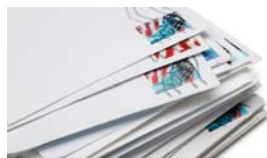
Our impressive range of services offers fantastic cross sale potential.

The international delivery market is growing and offers you the chance to benefit from high value, high margin services that you sell to your clients. No need to be collecting hundreds and hundreds or parcels a day to make a great income.