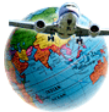
A local company with global capabilities, offering 100% client satisfaction.

The SMA Worldwide franchisee network has a massive opportunity to expand their individual businesses rapidly and earn even greater profits in the next few years.